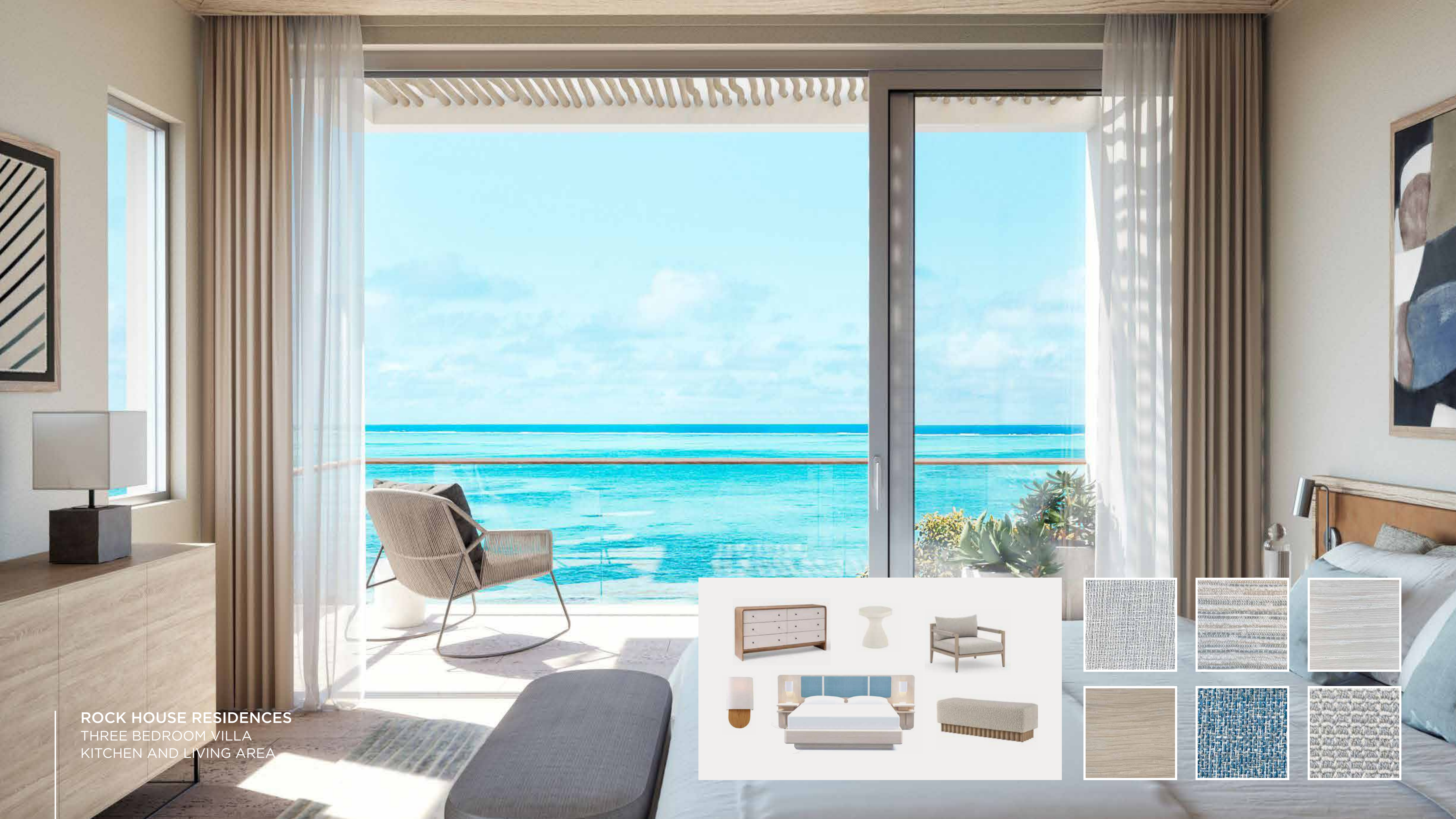
ROCK HOUSE RESIDENCES THREE BEDROOM VILLA KITCHEN AND LIVING AREA